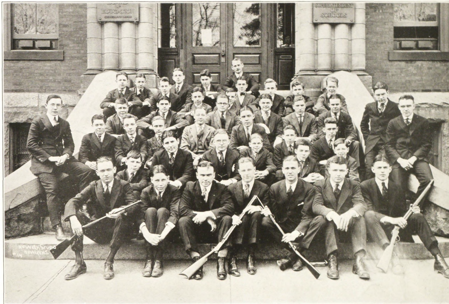
BOYS' RIFLE CLUB