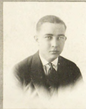
JOHN W. DANFORTH