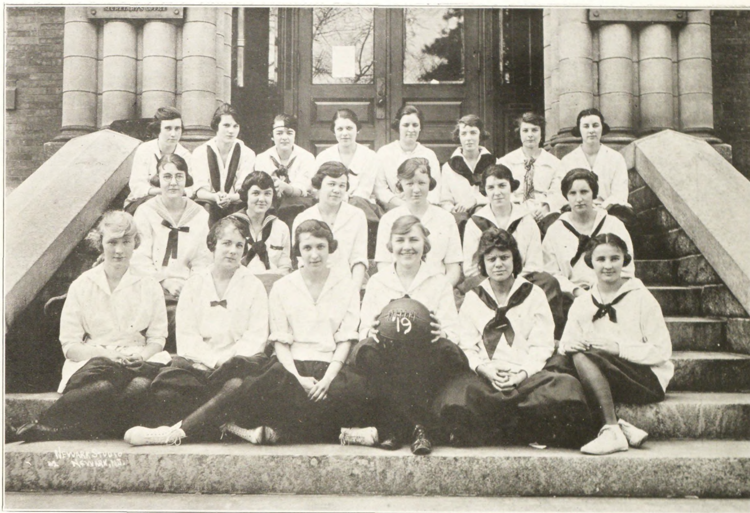
GIRLS' BASKETBALL TEAM