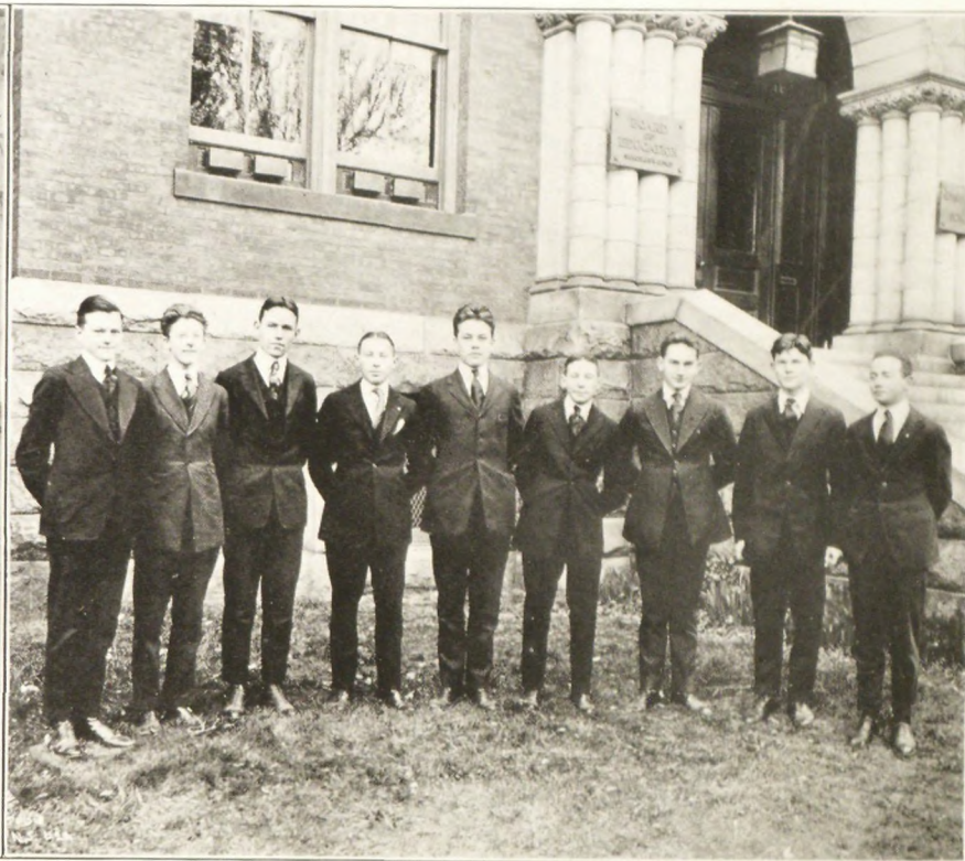
DEBATING TEAM AND DELTA EPSILON