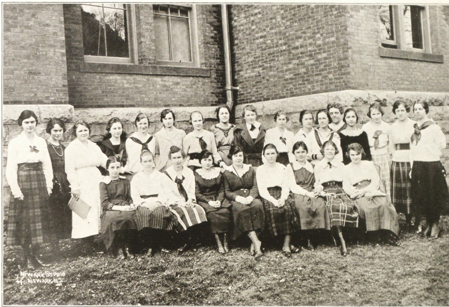
GIRLS' DEBATING CLUB