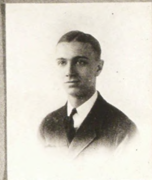
DONALD GORDON FOWLER "Don," "Duke" (General)