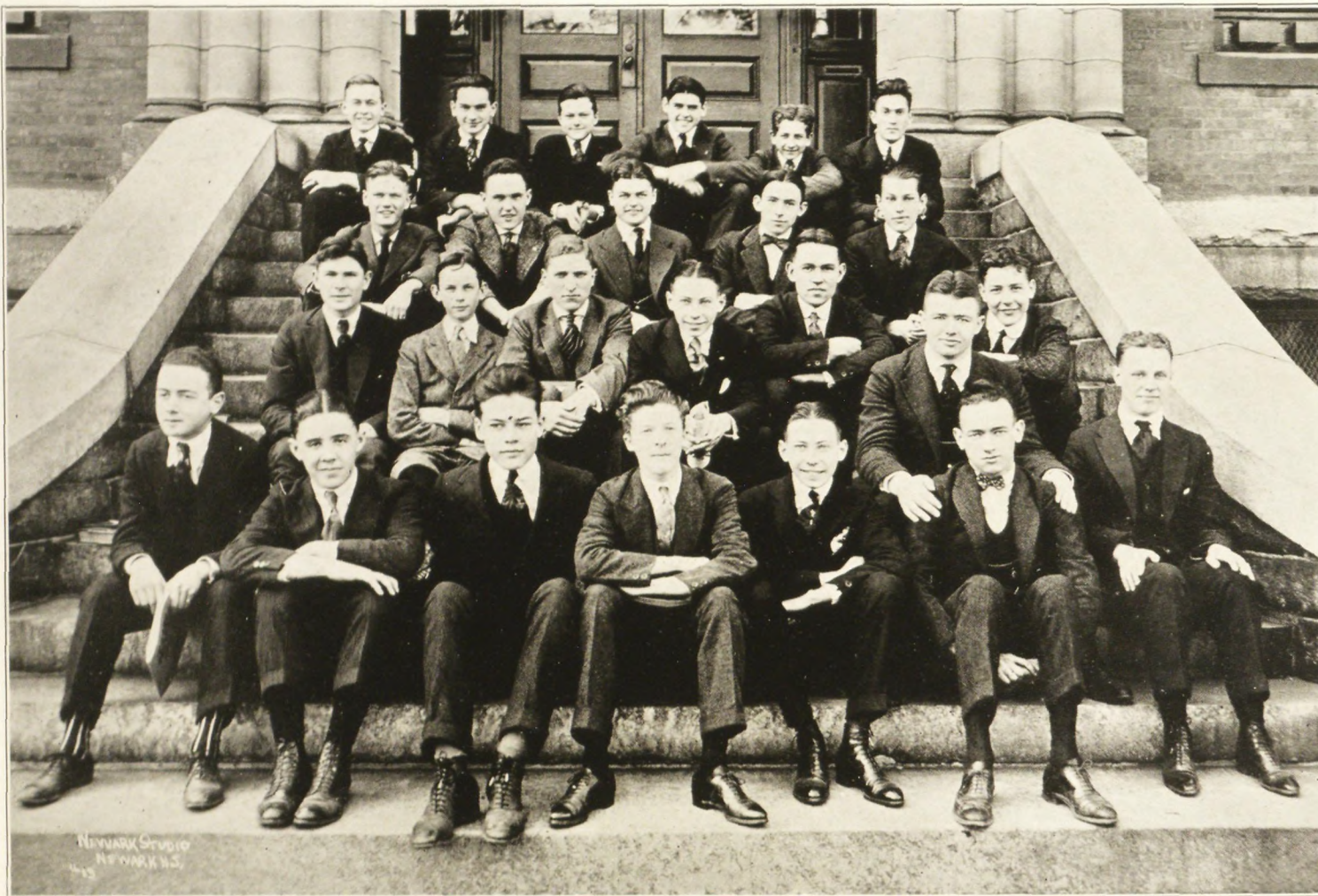
BOYS' DEBATING CLUB