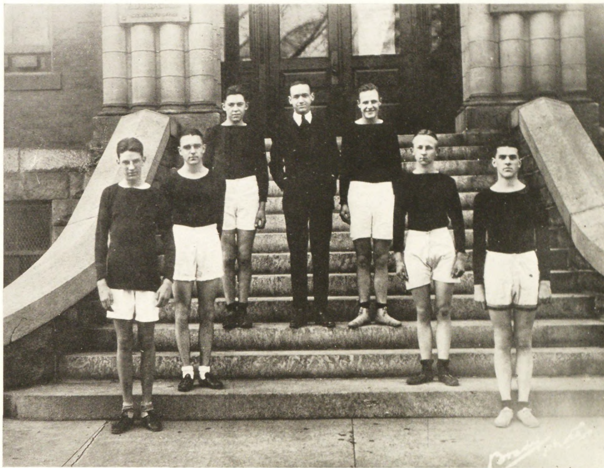
CROSS COUNTRY TEAM